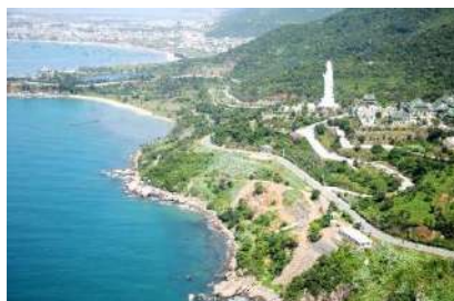
Son Tra Peninsula