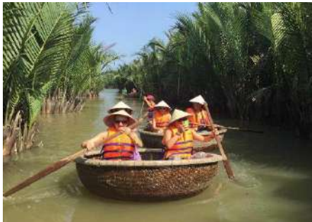
Pagoda Basket boat