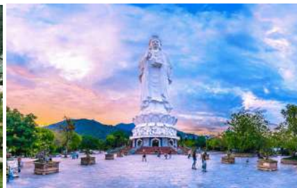
Linh Ung pagoda