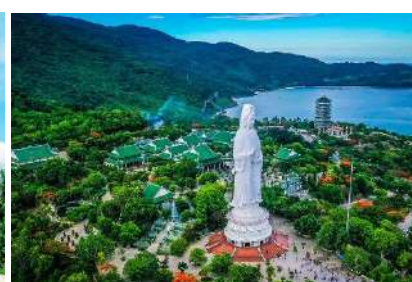
Linh Ung pagoda