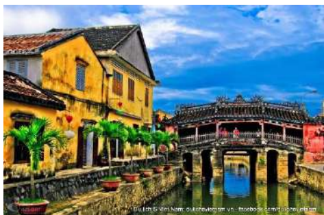
Japanese Covered Bridge