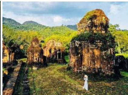
My Son Sanctuary